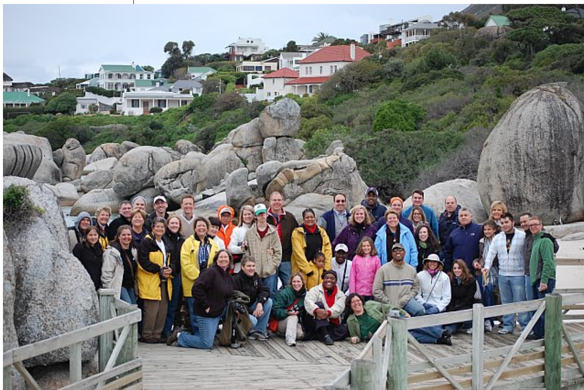
Cohort 7 in South Africa- Summer 2008