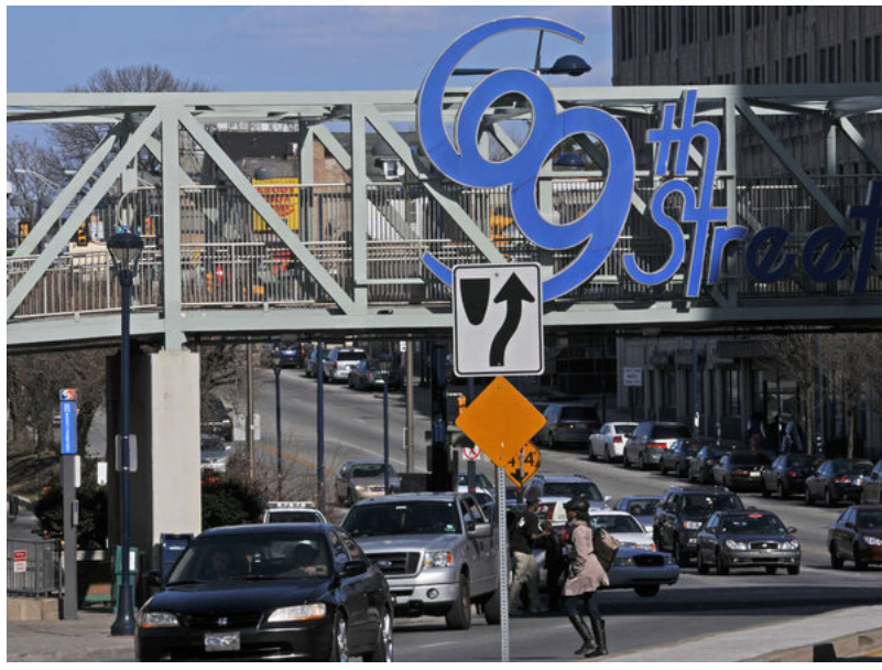
The 69th St. area ties Upper Darby to surrounding areas.