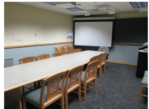
Solomon conference room B50