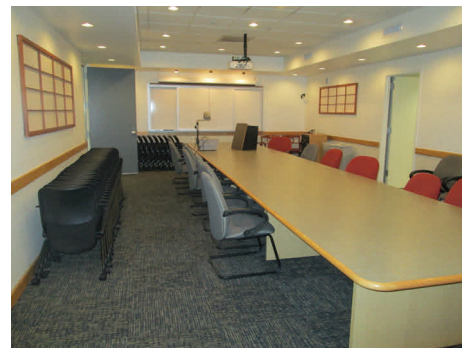
Solomon conference room B35