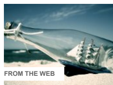
FROM THE WEB Hobbies Can Be Expensive. Here's Our Top 5. (Investopedia)