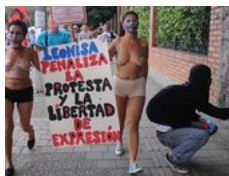
Briefly... CITY/REGION Philly.com