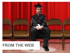
FROM THE WEB 11 Public Universities with the Worst Graduation Rates (The Fiscal Times)