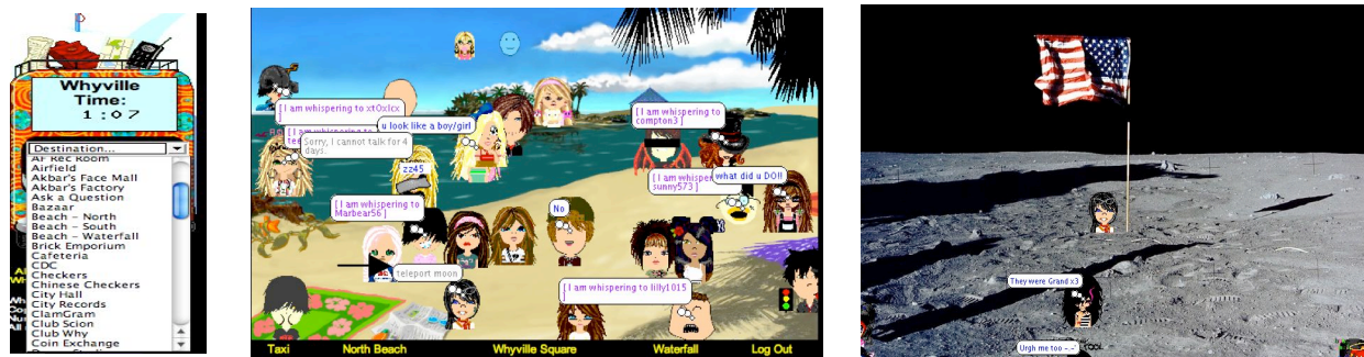
Figure 1: Destination Menu, Teleporting to the Moon from the Beach, the Moon

Some of the more popular places in which to socialize are not visible to users in the menus available on the site: Earth, Moon, Mars, Jupiter, Saturn, and the Newspaper. These sites can only be reached by “teleporting,” which is done by typing “teleport moon” (or “teleport [place]”) in the chat bubble above one’s head. Since teleporting cannot be observed on Whyville (users are zapped to the new location before others have a chance to read what they typed), the existence of these locations and the knowledge of how to get there can only be discovered through conversation with other people or by visiting one of the few cheat sites that has tips for Whyvillians. Because of this, these select places come to represent insider status and many players prize them as social hang-outs because they are not over-crowded or over-populated by newbies.